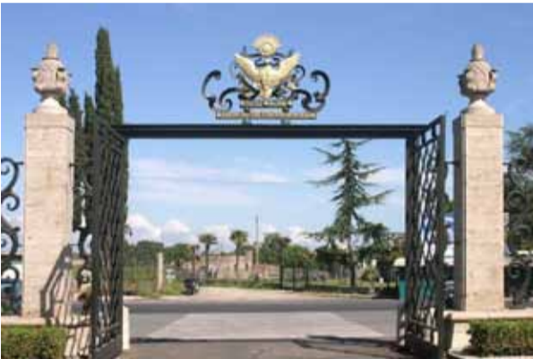
American Cemetery - Anzio

In early May the AJEX Southgate branch arranged a very unique trip - 82 veterans including wives, carers, widows, 2 military escorts and a doctor, travelled to Italy to honour those who died in WWII.