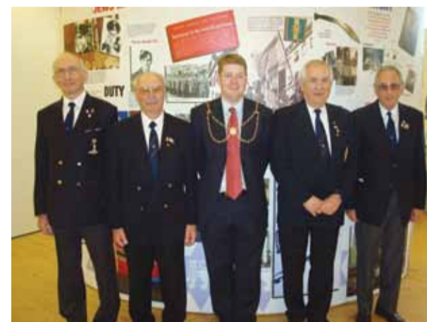
Delegates with Deputy Lord Mayor