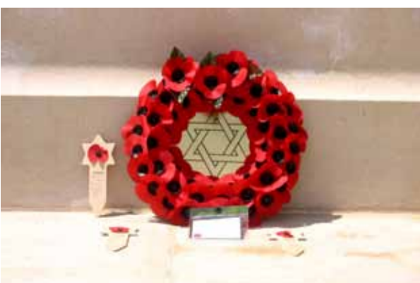
One of the Wreaths Laid in Italy