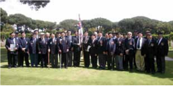
Veterans at Anzio Cemetery