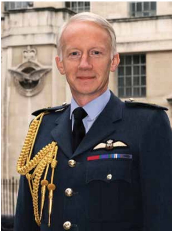
Air Chief Marshal Sir Stephen Dalton

O n 21 st November 2010, a week after Remembrance Sunday, AJEX will once again march down Whitehall to attend their annual Ceremony, in remembrance of the fallen British Jewish service men and women.